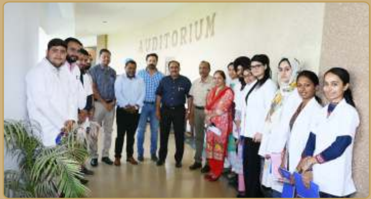
PG ORIENTATION PROGRAMME