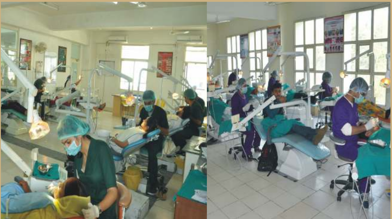
PG SECTIONS WORKING

As per Criteria laid down in the Government of Punjab Notification.