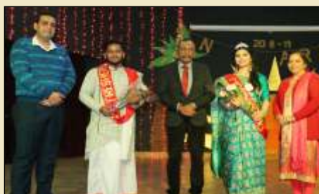
MISS AND MR. FRESHERS