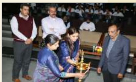
WORLD DENTISTS' DAY CELEBRATION