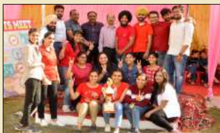
WINNERS OF GENESIS PREMIER LEAGUE (GPL)