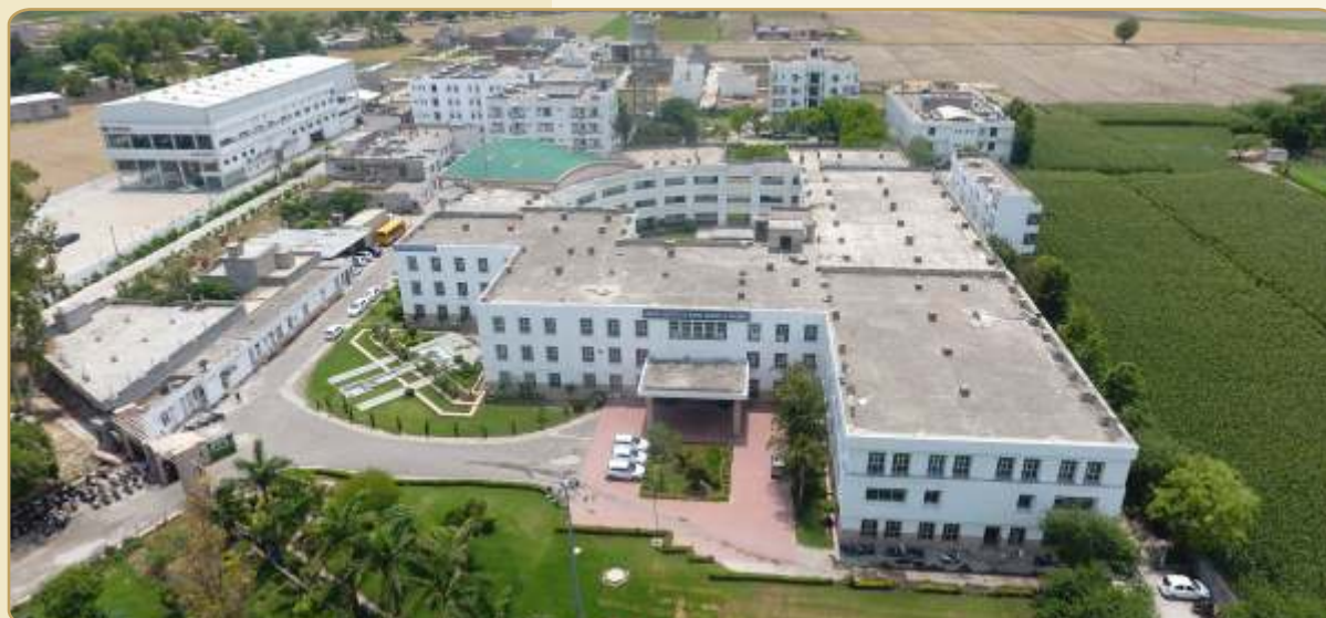
AREAL VIEW OF THE CAMPUS