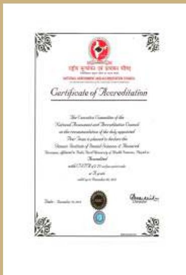
CERTIFICATE OF NAAC ACCREDITATION

The institute is an important Milestone on the 'Road map of the Trust' which has already established its credibility in "Health Care, Education and Research". The trust has a modern "Super Specialty" hospital and a "Nursing College" in the region. With the establishment of Genesis the contours of a Multi-dimensional Health hub in the region are complete. The society also offers B.Sc. (Nursing) Post Basic B.sc (Nursing) and G.N.M. Courses in the Nursing College. It has now been given the status of a Post Graduate institute, by being offered MDS Courses in Seven specialties. The ultimate aim of Shaheed Dr. Anil Baghi Charitable Society is to transform Ferozepur into a major Educational Research Hub and Health Tourism destination. The institute has also added various value added specialist courses in Implantology, Rotary Endodontics and Oral Rehabilitation, Laser Dentistry, Aesthetic and Restorative Dentistry, Dental Sedation and Pain Management, Smile Make overs, Clinical Prosthodontics, Comprehensive Pedodontics and Perio Esthetics. These are approved by Punjab Dental Council.