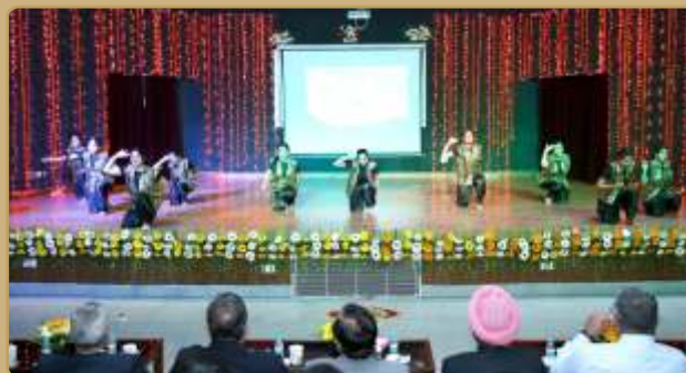
THEME DANCE PERFORMANCE

All the festivals are celebrated in true secular spirit