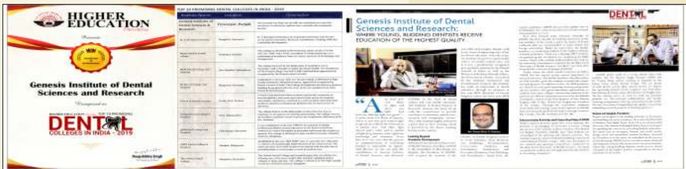
GENESIS IN MEDIA