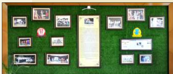
BOARD OF HONOR