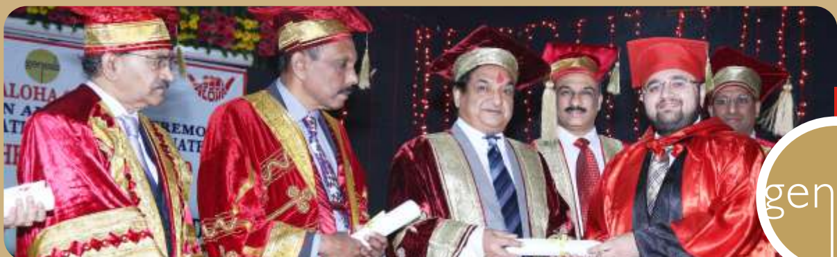
ANNUAL CONVOCATION & AWARDS CEREMONY