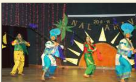
STUDENTS EXTRA CURRICULAR ACTIVITY