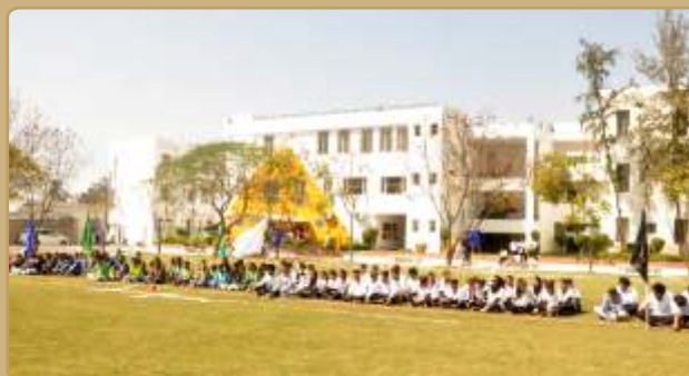
ANNUAL SPORTS MEET