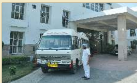
COMMUNITY DENTAL SERVICE