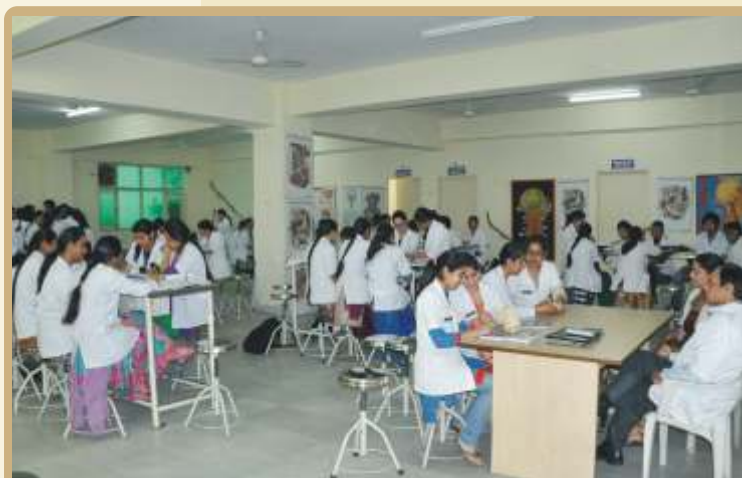
ANATOMY DISSECTION HALL

process is essential. Every candidate should take part in Seminars, Journal Clubs, Group Discussions, Case Demonstration, Clinics, Clinico-Pathologic Conferences and Clinical Meetings. Every candidate should participate in the teaching and training programme of the undergraduate students. Training should include involvement in laboratory and experimental work and research studies.