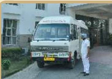
MOBILE DENTAL VAN