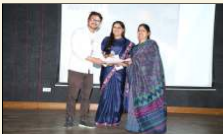
BEST SMILE COMPETITION AWARD